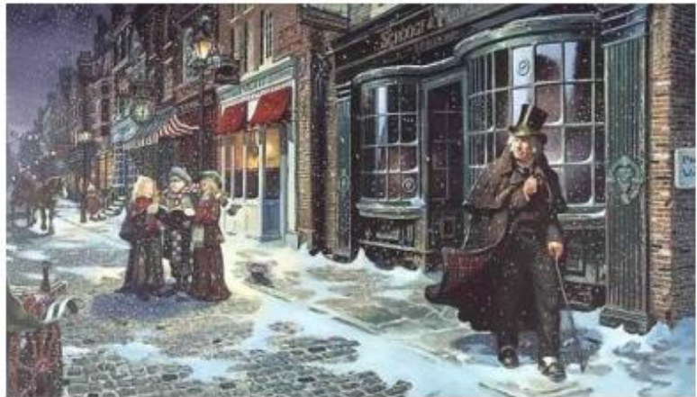
Sketches by Boz

At the outset, Scrooge is portrayed as a cold-hearted, self-centred shrewd and demanding moneylender that despises the frivolity of Christmas. "Bah, humbug!" He lives alone and is the surviving partner of the London firm of Marley and Scrooge. It is Christmas Eve. After grudgingly allowing his clerk, Tom Cratchit, the day off for Christmas, Scrooge returns home and retires to bed where he is visited by several 'spirits' – Jacob Marley, his long dead partner, and the three Ghosts of Christmas (Ghost of Christmas Past, Ghost of Christmas Present, and Ghost of Christmas Yet to Come.) When Scrooge awakes on Christmas morning, he immediately repents and becomes a model of generosity and kindness. A new man, he enters cheerfully into the spirit of the day. Henceforth, "... it was always said of him that he knew how to keep Christmas well if any man alive possessed the knowledge."