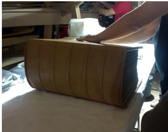
Image shows the bulk of the Codex Amiatinus