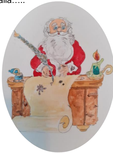
Image hand drawn by our WM It is supposed to be a representation of your Secretary hard at work...